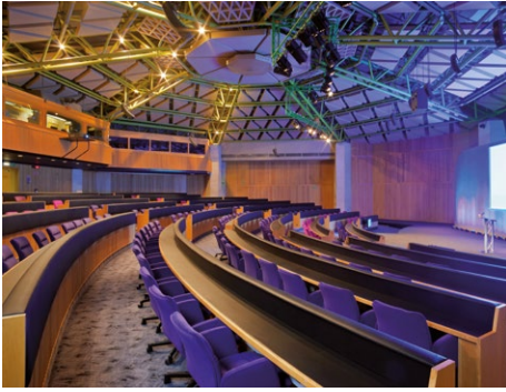
Heythrop Park Resort