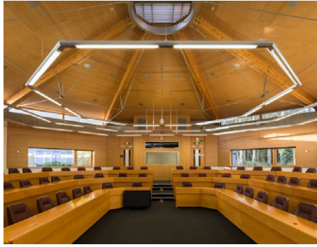
Saïd Business School: Egrove Park, Oxford