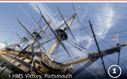
> HMS Victory, Portsmouth

Four days is just the right amount of time to discover some of the best bits of the Midlands and the South of England. This itinerary will give you a balanced dose of culture, history, outdoors activities, shopping and food. Walk in the footsteps of a Jane Austen character, hunt for bargains in a Regency seaside town and learn more about England's fascinating maritime heritage.