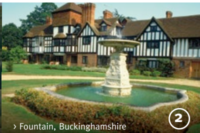
> Fountain, Buckinghamshire