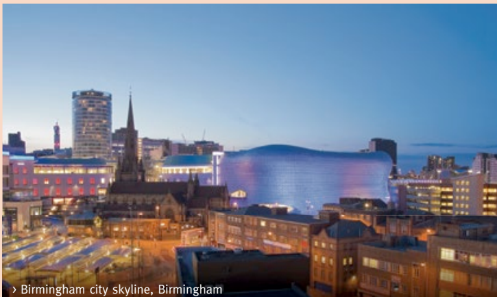
> Birmingham city skyline, Birmingham

Finish the evening off with an authentic Balti at one of 40-plus Indian restaurants located in the city's Balti Triangle or indulge in fine cuisine at the Michelin-starred Purnell's Restaurant.