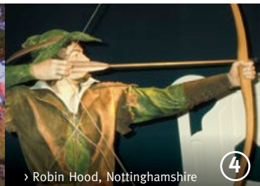
> Robin Hood, Nottinghamshire