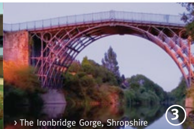
> The Ironbridge Gorge, Shropshire