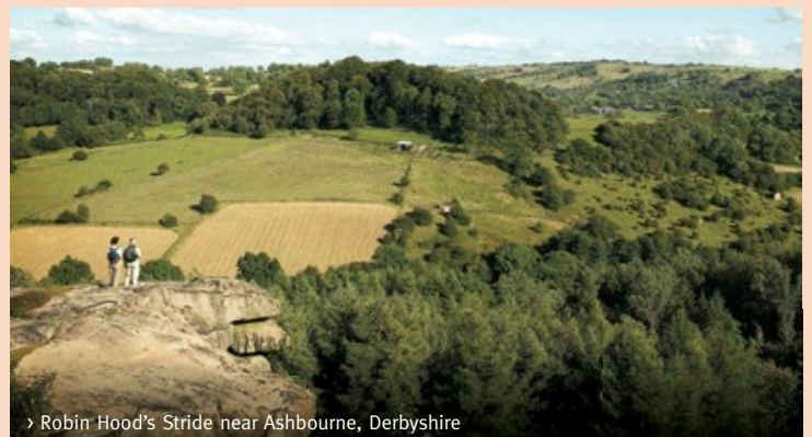
> Robin Hood's Stride near Ashbourne, Derbyshire

The Square, Bakewell, DE45 1BT www.rutlandarmsbakewell.co.uk