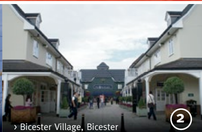
> Bicester Village, Bicester