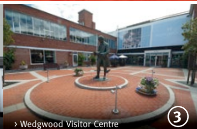
> Wedgwood Visitor Centre