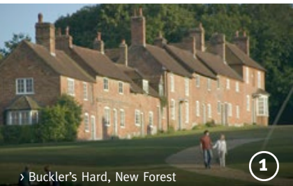
> Buckler's Hard, New Forest